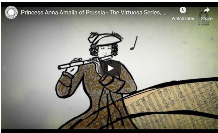
Ep01 Princess Anna Amalia of Prussia https://youtu.be/Hmbt9h4QreA