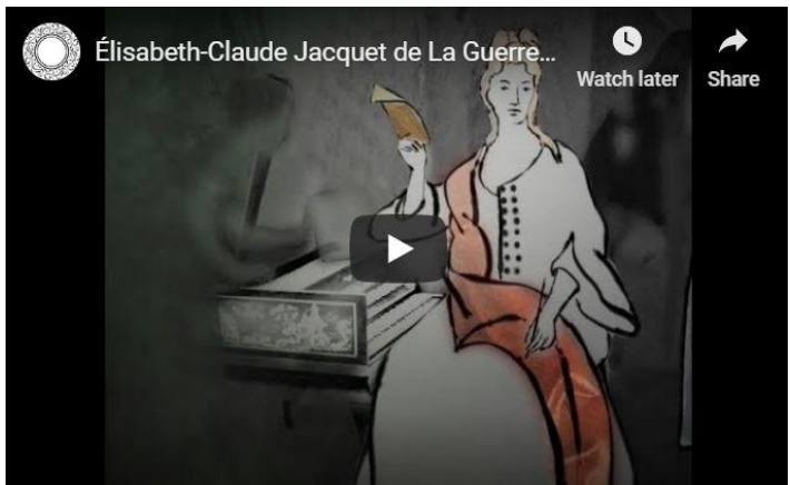
Ep 04 Élisabeth-Claude Jacquet de La Guerre https://youtu.be/-bu5r-hseiA