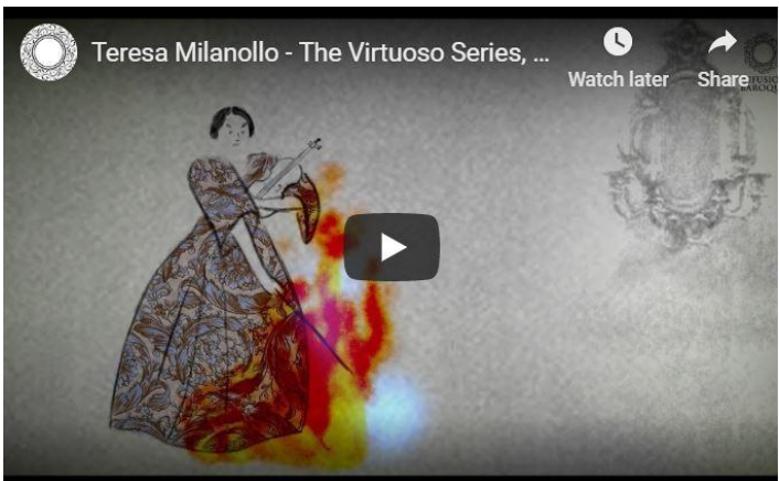
Ep03 Teresa Milanollo https://youtu.be/yTNGHUuMOnQ